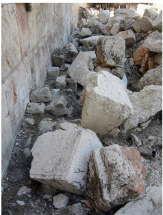
Rocks left after Temple Destroyed in 70 AD

Luke 21:6+ "As for these things which you are looking at, the days will come in which there will not be left one stone upon another which will not be torn down."